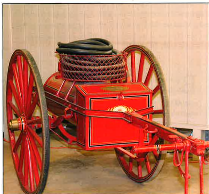
This ca. 1890 Obenchain Boyer chemical cart served for years as a demonstrator at the Boyer company headquarters in Logansport, Indiana.