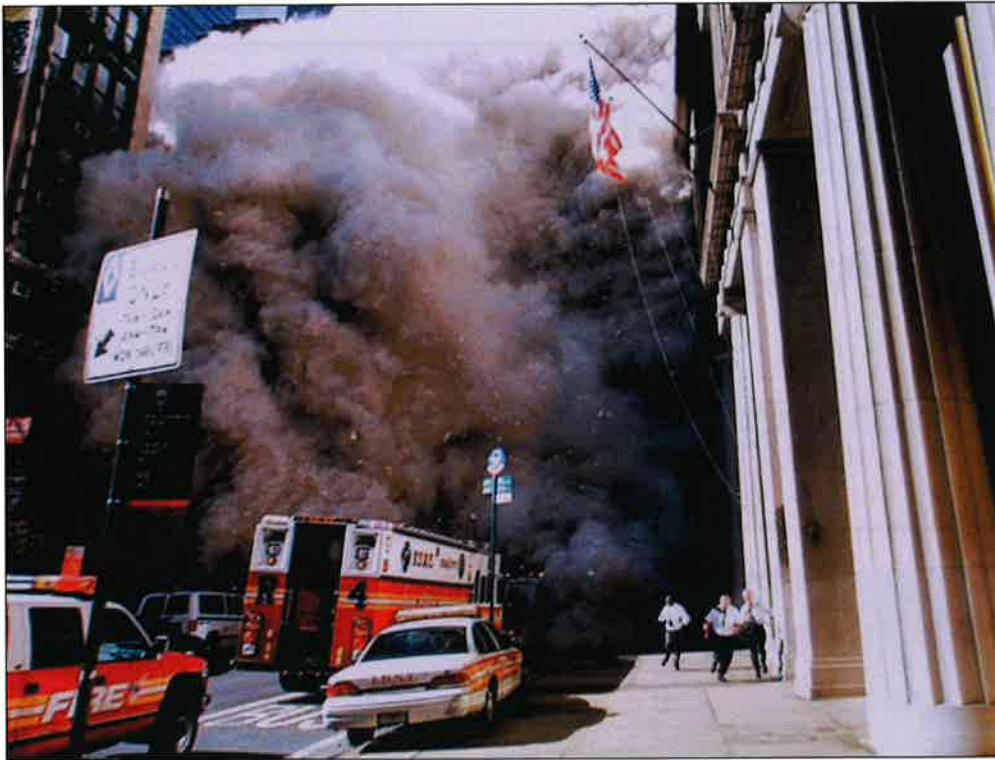
Parked on Broadway, Rescue 4 is partially destroyed in the collapse of the South Tower on the morning of September 11, 2001.

The truck is a 1996 HME / Saulsbury, one of five identical rigs purchased by FDNY in 1996; one for each of the city's five boroughs. This rig was assigned to Rescue Company 4 in Queens. On the morning of September 11, 2001, Rescue 4 responded to the attack on the World Trade Center, arriving two blocks east of the South Tower, at 195 Broadway. The truck carried eight firefighters to the South Tower: five regular crew members plus three firefighters detailed from Squad 288, Rescue Company 5 and Ladder Company 136. Rescue 4's Captain Brian Hickey was detailed to Rescue 3 and went to the Trade Center on Rescue 3. Captain Hickey was killed in action. All eight of the firefighters who responded in Rescue 4 were also killed while rescuing victims in the South Tower. The crew members were Lieutenant Kevin Dowdell and firefighters Terrence P. Farrell, William J. Mahoney, Peter A. Nelson, Darrell V. Pearsall, Peter Brennan (detailed from Squad 288), Alan Tarasiewicz (detailed from Rescue 5) and Michael J. Curley (detailed from Ladder 136). 343 FDNY firefighters, one volunteer firefighter, 23 NYPD officers, and 37 Port Authority officers died in the collapse of the Towers. A total of 2,819 people died in the collapse.