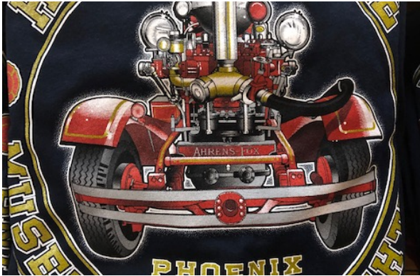
AHRENS FOX CIRCLE