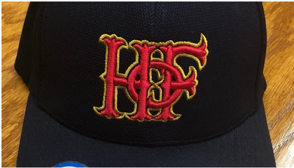
COOL & DRY HOF RED & GOLD CAP