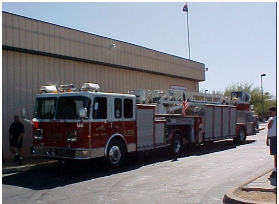
Tempe Fire Department brought an Aerial Truck.