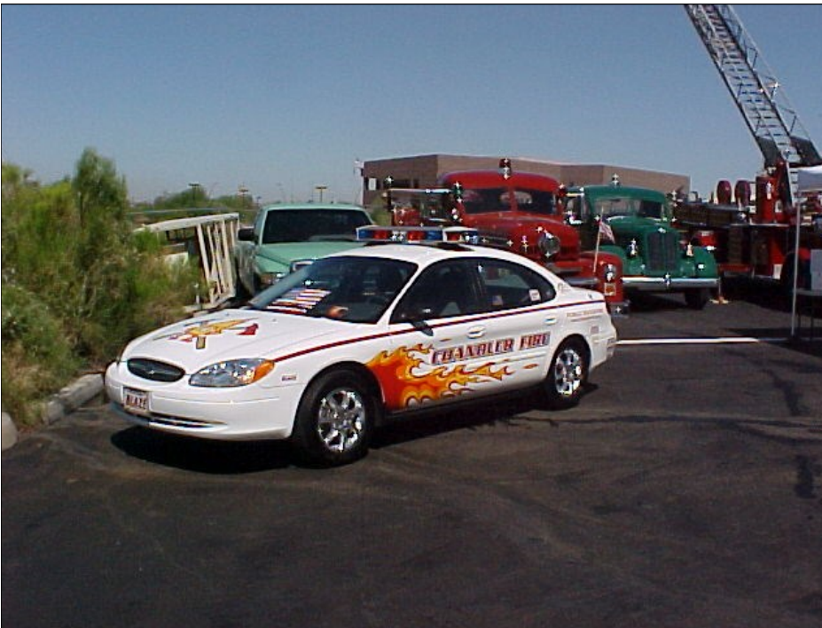
Chandler Fire Department brought "Blaze", their fire-education car.