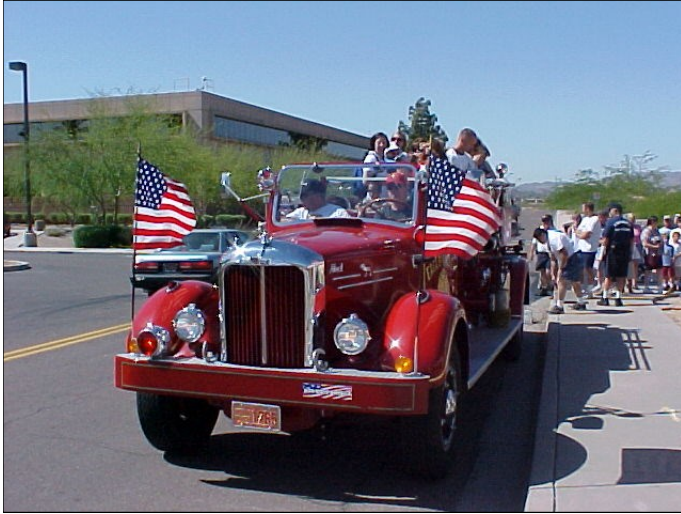
Families loading aboard a 1951 Mack fire engine for a ride around the block.