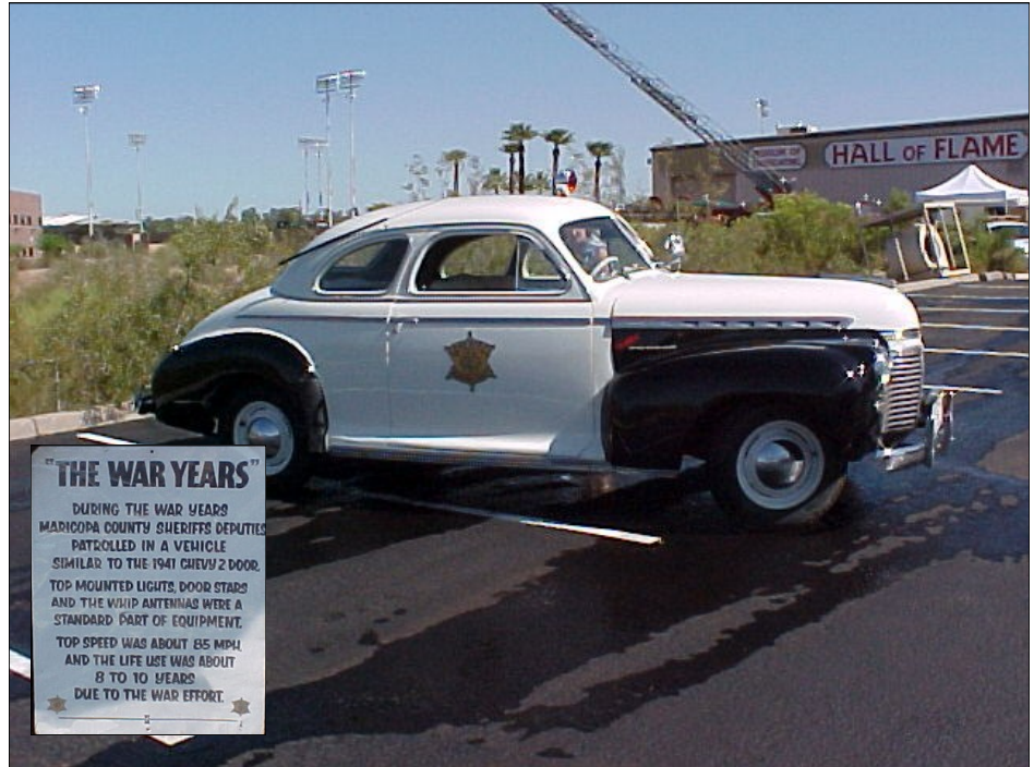
The Maricopa County Sheriffs Office brought this antique 1940's era police car.