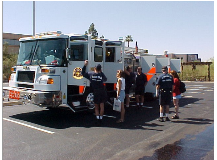
While Museum volunteers pump, a young visitor and his dad play water from an 1800's era hand-pumper.