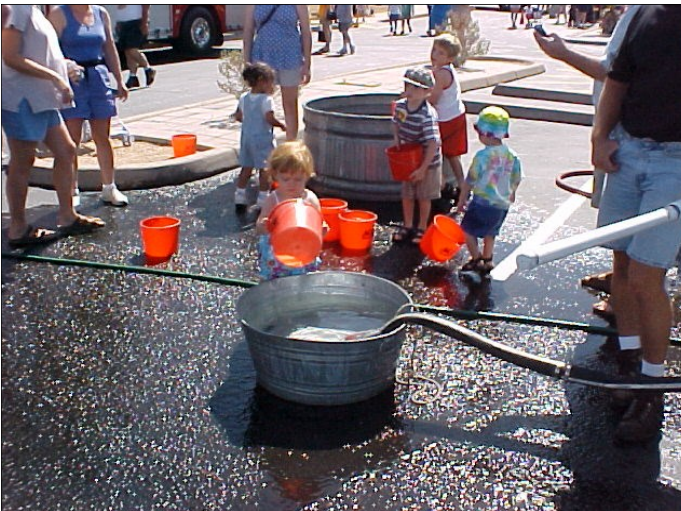
Some junior firefighters help out with the bucket brigade while their parents look on..