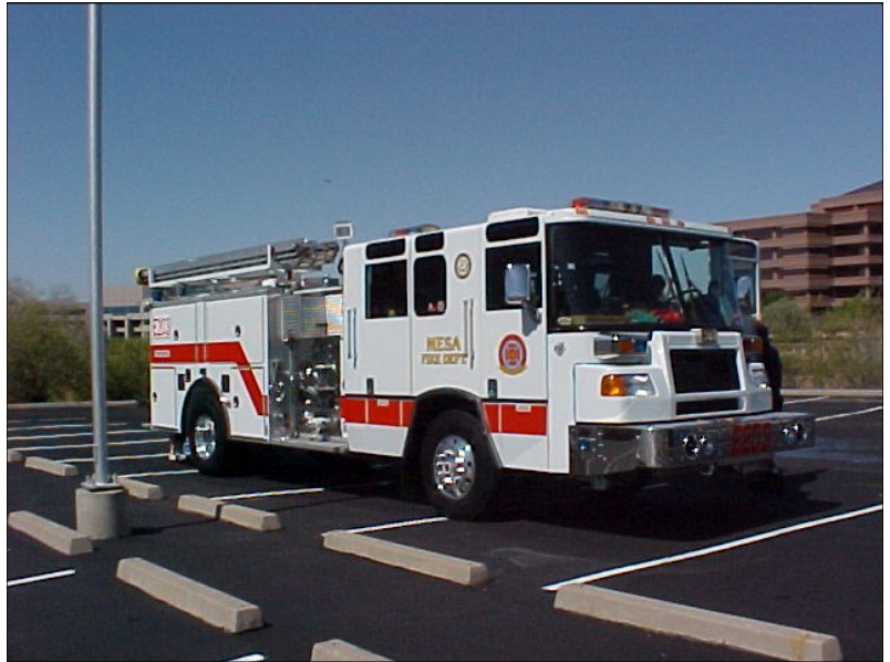
The City Of Mesa Fire Department brought a Pumper for Families to look at.

Now, if you missed our 2002 Summer Safety Fair you will have another chance next year at our 4 th annual Summer Safety Fair. Don't forget to join us this October 26 th for the Hall of Flame Museum's 3 rd annual Fire House Fun Day.