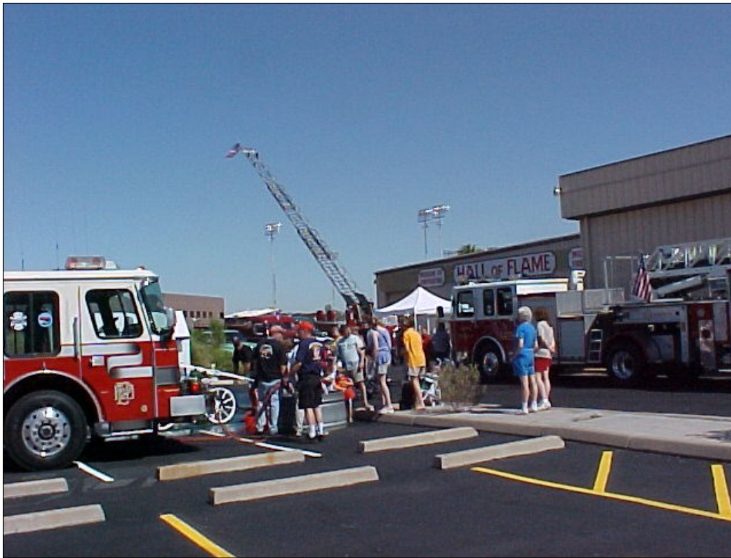
Firefighters from Phoenix and Tempe, museum volunteers, and families from all over Arizona enjoying a beautiful late spring day at the Hall of Flame Museum's 3rd annual Summer Safety Fair.

On Saturday, May 18 th , the Hall of Flame Museum of Firefighting celebrated our third annual free Summer Safety Fair. Families from all over the Valley of the Sun came to the museum from 9:00 a.m. to 1:00 p.m. to have fun