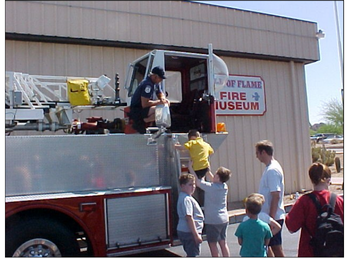
Above: A Tempe Firefighter helps kids into the Tiller seat of their aerial truck. Below: Mesa Firefighters show off their pumper.