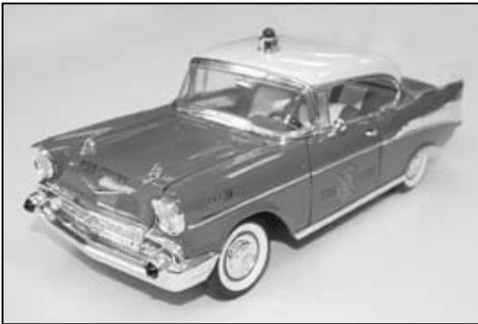
1957 Chevrolet Chief's Car

A few of Ron's donations are displayed on this page and on page 5.