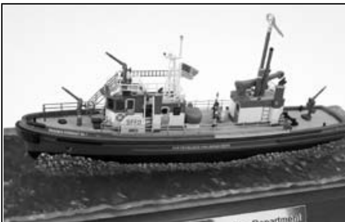
San Francisco Fireboat