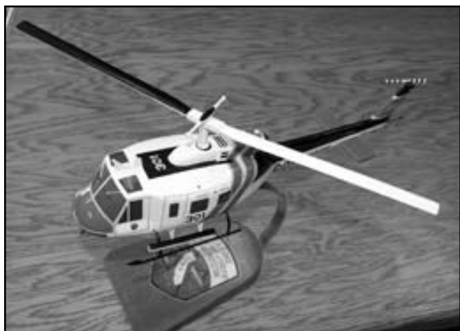
Above: Bell Model 212 Super Huey. Used by the CDF and many other wildland firefighting organizations to transport crews to fires and to carry "Bambi Buckets" of water for delivery on a fire.