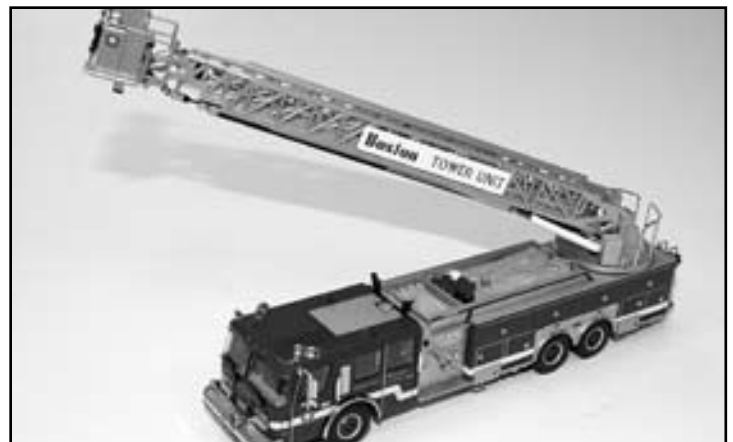
E - One Tower Ladder Truck - Boston FD