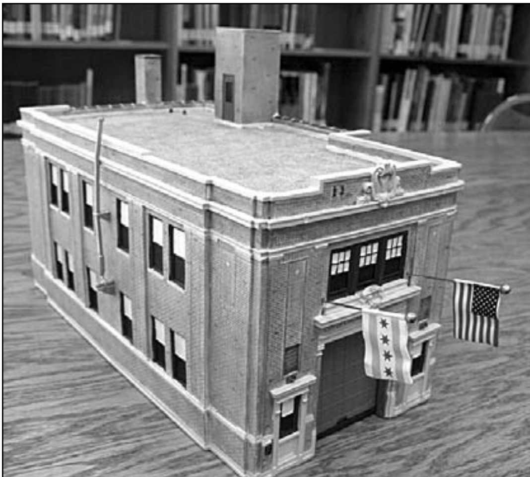
Chicago Station 78 Wrigley Field Built 1915