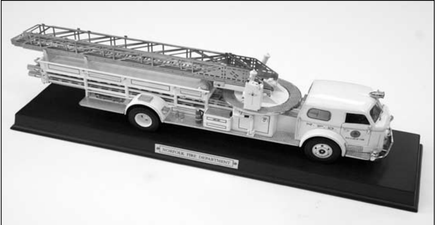
American La France Aerial Fire Truck - Norfolk, VA