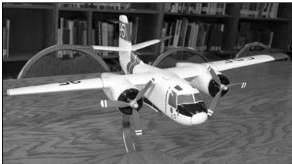
Left: Grumman S-2A Tracker. Now used as air tankers by the CDF, Trackers were built as carrier based anti submarine aircraft.