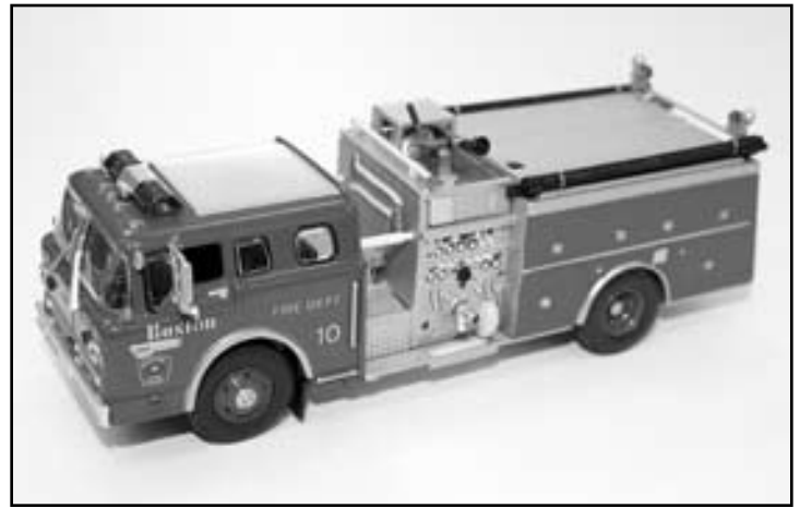
1980 Ford Engine - Boston FD