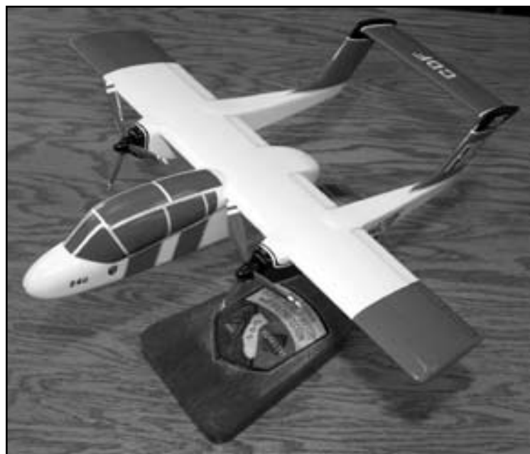
Above: Rockwell OV-10 Bronco with CDF markings. CDF uses a number of these retired Marine Corps aircraft as "air attack platforms" to control ground operations at a wildland fire and to guide large air tankers onto a fire.