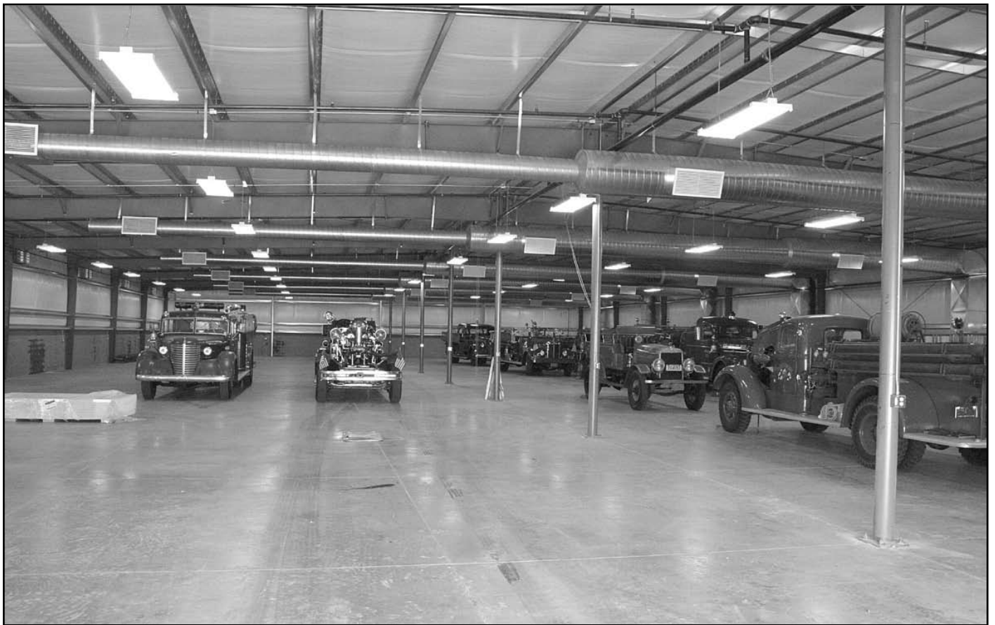
Top: By November the exterior block wall was in place and workers began to install the roof, not neglecting to insert rolls of insulation. The building is heavily insulated on both the roof and side walls. Above: The completed interior. A number of wheeled pieces from the main building, as well as a pair of new accessions are in place. Except for a single row of center posts the entire slab is available for storage.