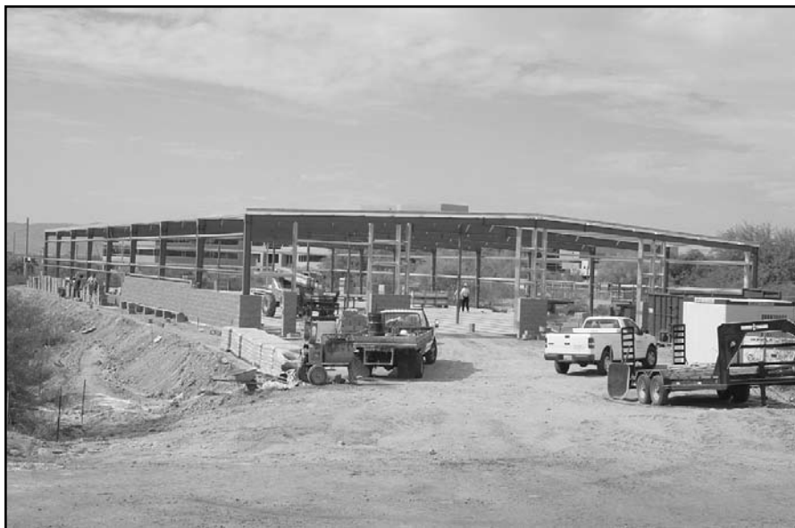
Upper Left: Site prep begins in September of 2007.