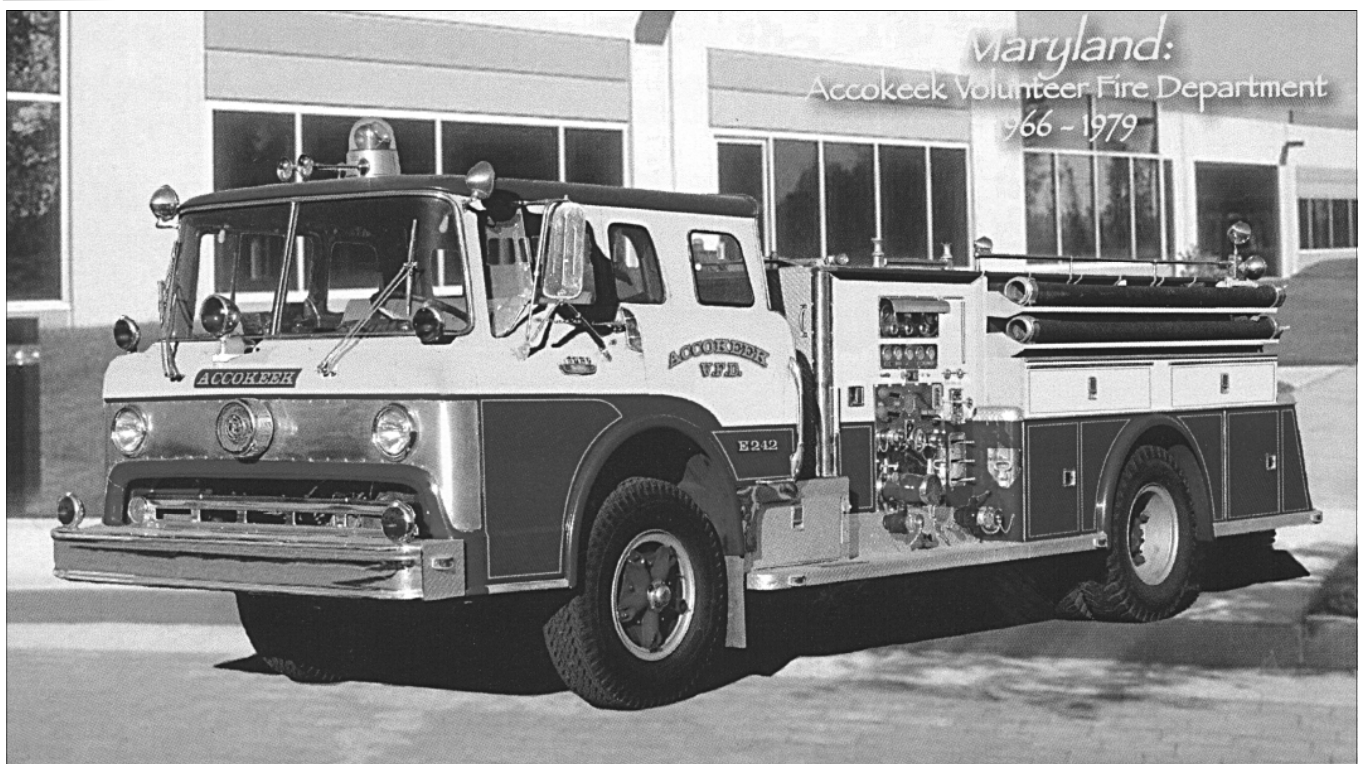
Above :The Model C in its original paint scheme of red and cream in Accokeek. Below: The Model C in the Hall of Flame Study Collection Building.