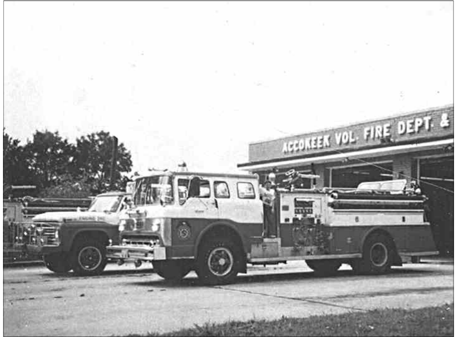
The Young / Ford outside of the Accokeek Volunteer FD around 1968.

Our rig, made in 1965, is in excellent running condition and is well equipped. Beyond its original motor, the engine also has a Hale two stage centrifugal pump rated at 750 gpm, a 500 gallon booster tank, two Hannay automatic booster hose reels, six discharge ports, and a canopy cab with seating for six firemen. As the illustration above shows, it's easy to access the motor, and Ford parts are available almost anywhere. It has a synchromesh five speed manual transmission. The cab interior and dashboard are original. The Highlands Fire District repainted the engine sometime in the 1980s. We plan to leave the truck with this color scheme and markings. We are pleased to add such an iconic American fire engine of the second half of the twentieth century to the collection. Many thanks to Dave Scott for his generosity.