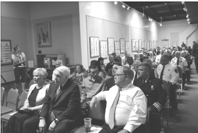
Left: A portion of the group of attendees.

Each fallen hotshot was memorialized with an engraved brick embedded in the floor of the museum’s National Firefighting Hall of Heroes. The hotshots are also listed on the walls of the Hall of Heroes as well as its computer database of firefighters who have died on the line of duty.